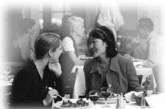
Normal Sensitivity Red dot at 3:00 o'clock