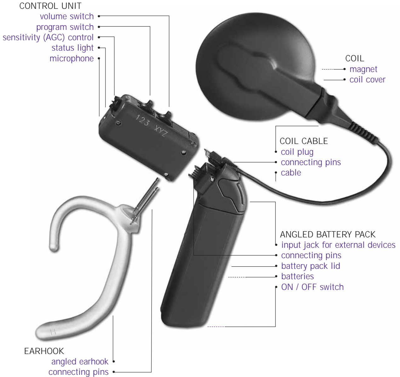
TEMPO+ is enlarged to show detail