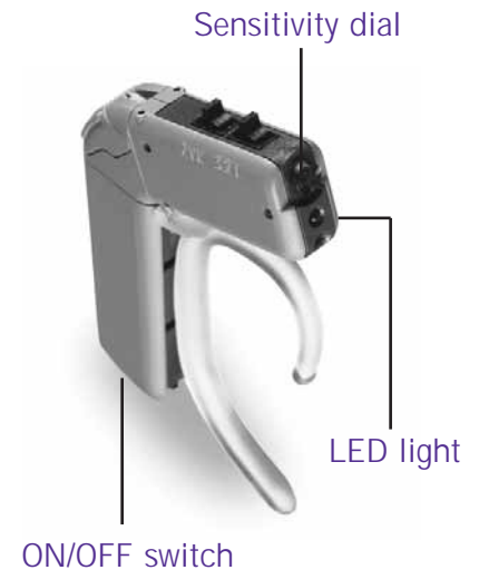
See next page for a detailed diagram of the TEMPO+ speech processor.