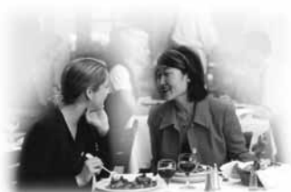
Low Sensitivity Red dot at 12:00 o'clock