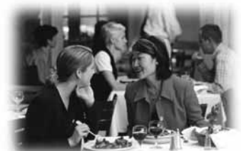
High Sensitivity Red dot at 7:00 o'clock

Doing a daily listening check to assess the child's detection and discrimination skills, as well as to verify the function of the speech processor, will ensure that a child with a cochlear implant is able to participate fully in the school day, and will boost your confidence as well. It provides an opportunity to spend a few minutes each day focusing on listening skills, which will in turn help to develop consistent listening behavior, as well as potentially identify when a child should return to the implant center for fine-tuning of the speech processor program.